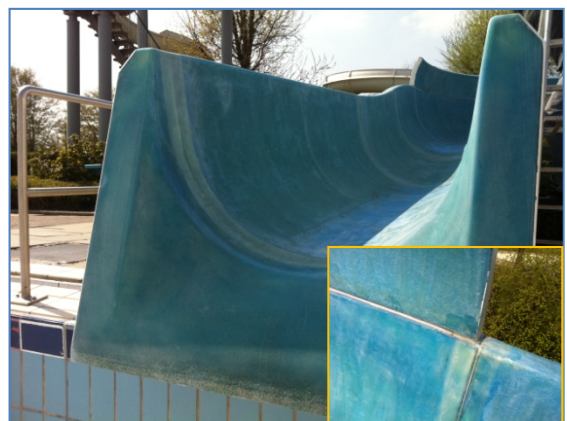
joint less - safety

Deutsche Composite GmbH Taking German Composite Technology to the Next Level