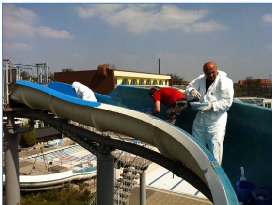
Coat of the renovated chute